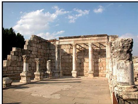
Actual Site of Synagogue in Capernaum where Jesus taught. These ruins were built over the original synagogue.

27 The people were all so amazed that they asked each other, "What is this? A new teaching -- and with authority! He even gives orders to evil spirits and they obey him." 28 News about him spread quickly over the whole region of Galilee.